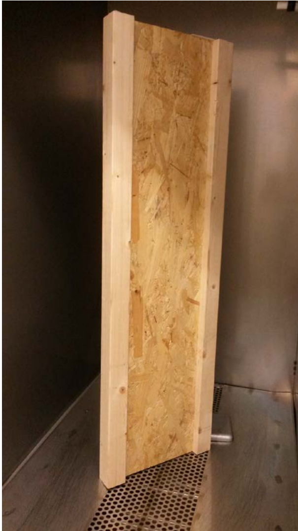
Photo of the test specimen